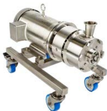
Production size models shown: DS-425, DS-850

New DS-850 model allows for greater throughput!